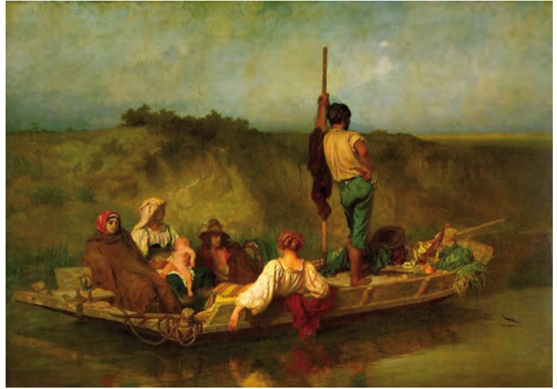
Fig. 4. Detail of La Malaria (1850-1851), oil on canvas by French artist Antoine Auguste Ernest Hébert (1817–1908). Hébert's painting conveyed admirably the melancholy of diseased country people and the blurring pestilential environment where they lived. The mala aria (bad air) can be indeed perceived in the painting, one of the best-known works of the artist. This painting was on the cover of Int Microbiol 2006, issue 9(2).

But microbes may also be responsible for certain miracles . The bacterium Serratia marcescens , which produces a red pigment, is responsible for the Miracle of Daroca (1238) and the Miracle of Bolsena (1263), where Mass hosts were found soaked in “blood,” or account for the miraculous appearance of blood on the Eucharist that led to Pope Urban IV (1195–1264) instituting the celebration of the Corpus Christi in 1264 [6].